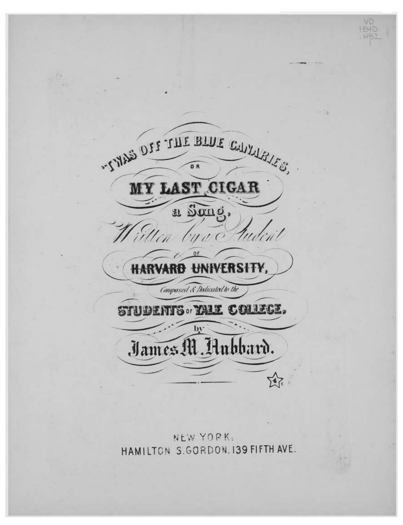
Cover of the earliest (1844) edition of "My Last Cigar"