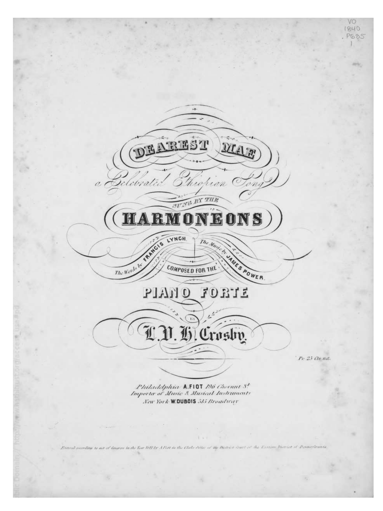
Cover of the earliest (1847) edition of "Dearest Mae"