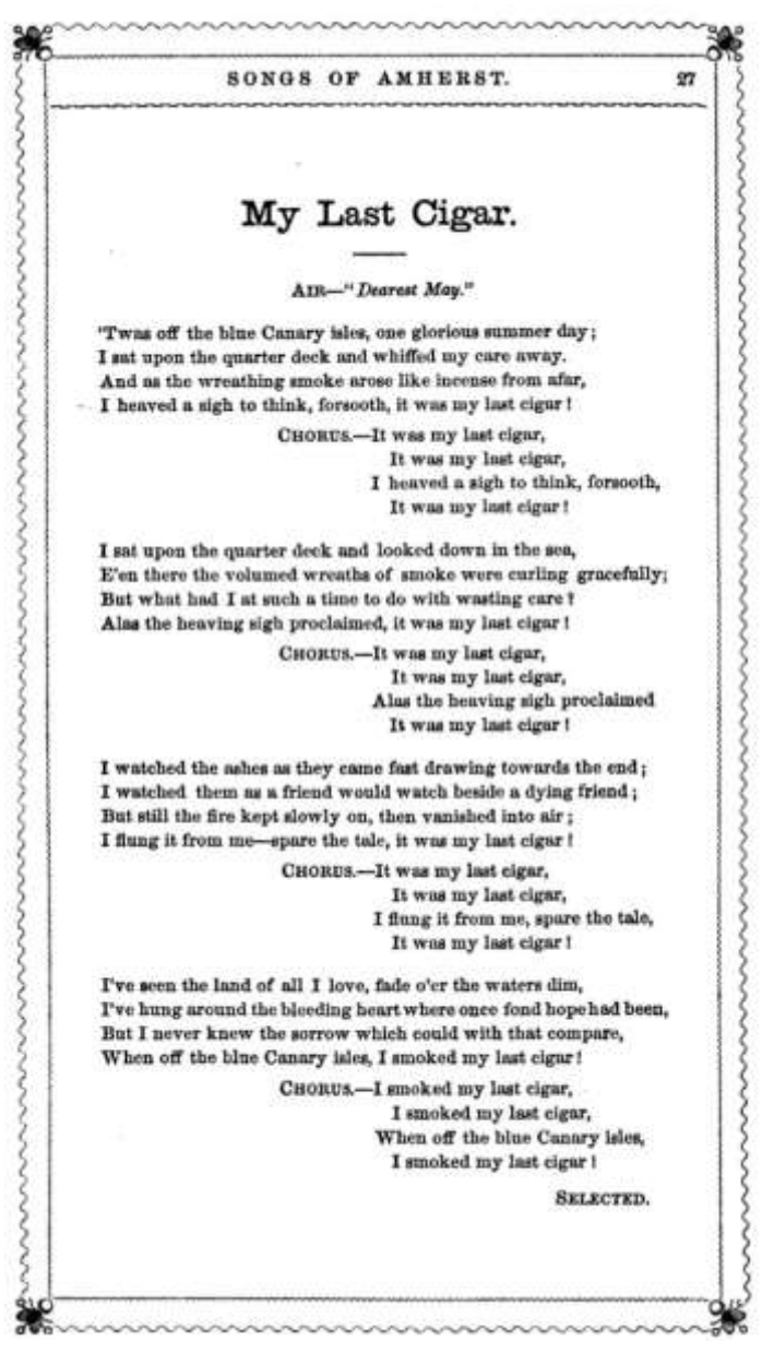
Songs of Amherst identifies the new and more popular tune of "My Last Cigar."

On page 27 we find "My Last Cigar" in its 32-verse, four-stanza version, under the inscription "Air—Dearest May". As it turns out, "Dearest May" is a misspelling of "Dearest Mae", a song written and published by the Harmoneons, a popular touring minstrel group from Boston. The original 1847